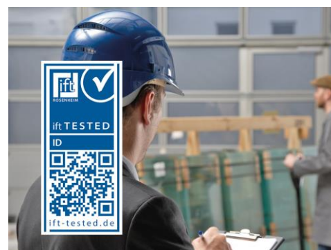
Picture 1 With the "ift-geprüft" mark, planners, dealers, tendering authorities and end users can easily check the authenticity of test certificates.

In the media and also in our personal environment, we all regularly experience how often data and documents are falsified and manipulated. Therefore, trust in information is generally dwindling, but at the same time people's competence in evaluating information and its sources is also increasing. Of course, the building sector is not exempt from this. Therefore, ift Rosenheim has developed a procedure with which every buyer of building materials, building elements and personal protective equipment (FFP2 masks, etc.) can verify the authenticity of ift certificates and test reports. The ift-tested mark shows that one or more properties of a product have been tested and evaluated by ift Rosenheim. Planners, dealers, tendering authorities and end users can thus be sure that the products bearing the mark have been tested independently, competently and in accordance with current standards by an internationally renowned testing institute.